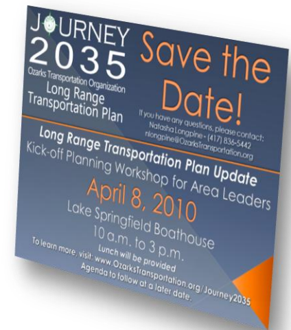
Figure 2 - Save the Date Card for Workshop

One unique feature of this event was the assignment of attendees to a table. Each breakout table was arranged so attendees were mixed based on their backgrounds and geographic representation. These groups sat together during the first visioning exercise and then were rearranged for the next set of