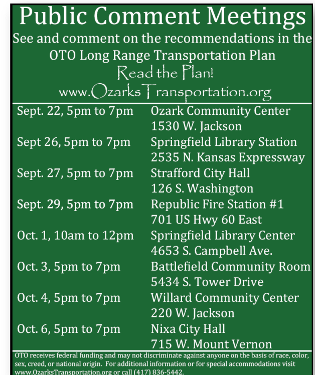
Figure 5 - Advertisement for Public Hearings

Public Hearings were scheduled in September and October of 2011 to gather comments on the final plan document. A public hearing was included as part of the regular OTO Board of Directors meeting on October 20, 2011. The meetings were advertised