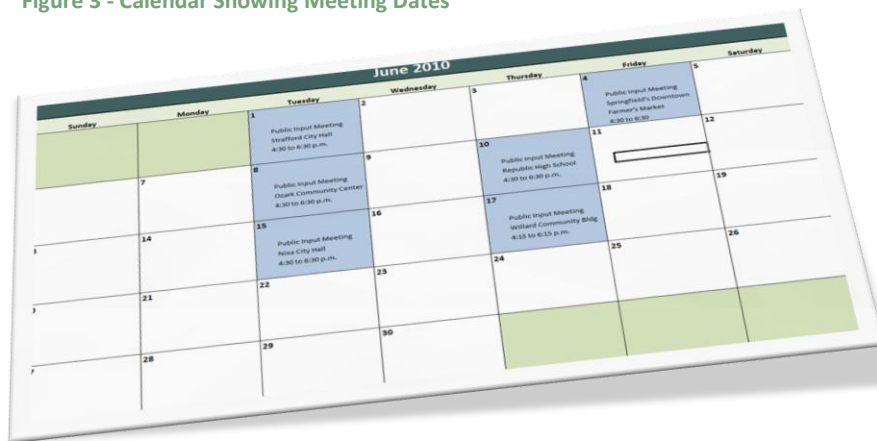
Figure 3 - Calendar Showing Meeting Dates

June 1, 4:30 to 6:30 p.m. – Strafford City Hall