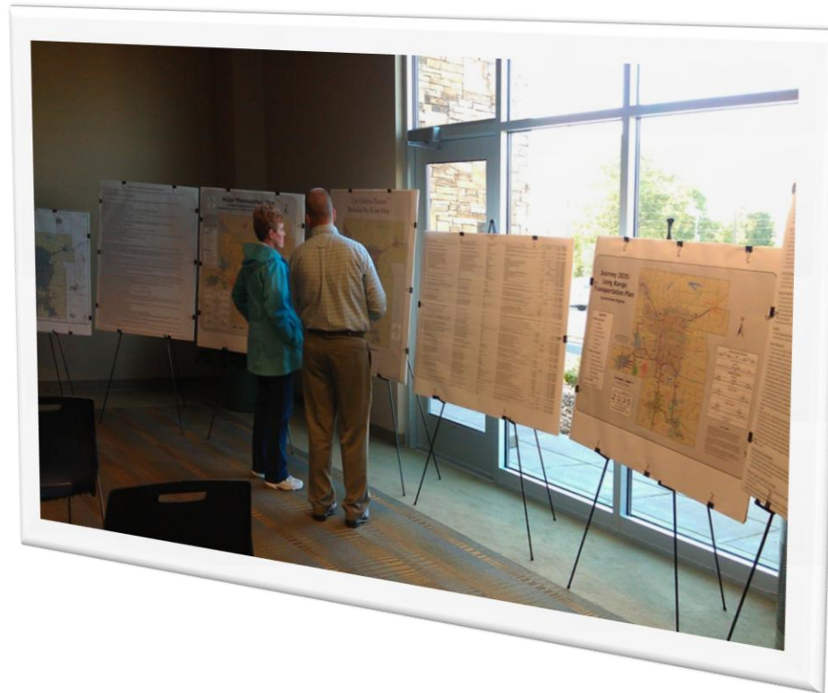
Figure 6 - At the Public Hearing in Ozark

Comments that were received during the public meetings have been shared with the Technical Planning Committee and the Board of Directors, as well as agencies that might also be impacted by the comments. Several comments are already addressed by the Plan or other OTO activities. Those comments pertaining to specific projects will be reviewed again as those projects move forward.