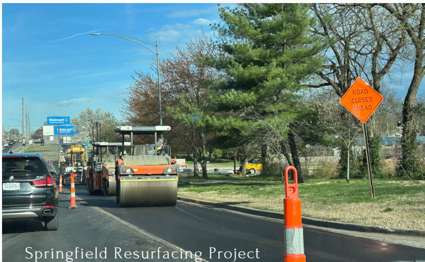
Springfield Resurfacing Project