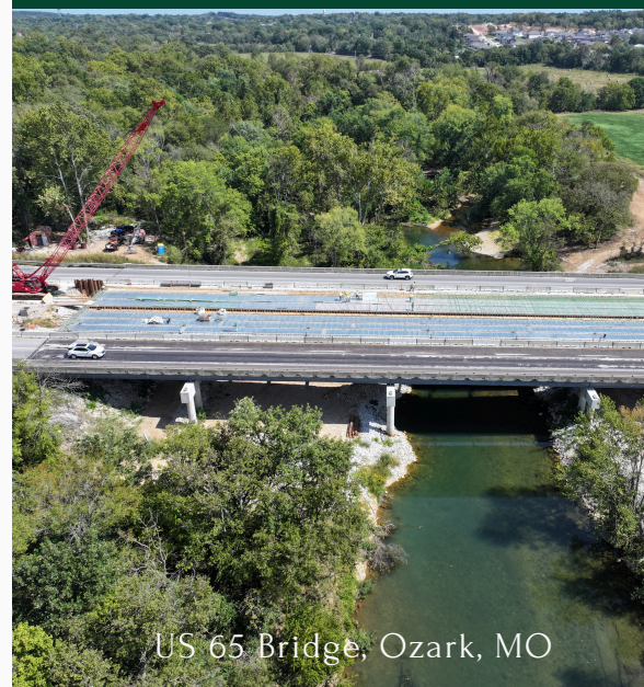
US 65 Bridge, Ozark, MO

Sunshine Bridge closed in Springfield between Scenic and Kansas Expressway. Completion scheduled for December 4 th , 2025.