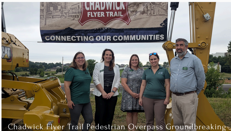
Chadwick Flyer Trail Pedestrian Overpass Groundbreaking

OTO Offices Closed for LABOR DAY SEPTEMBER 1, 2025