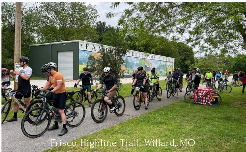
Frisco Highline Trail, Willard, MO

MoDNR is now accepting applications under the ORLP program for projects that create new outdoor recreation spaces, reinvigorate existing parks and form connections between people and outdoors.