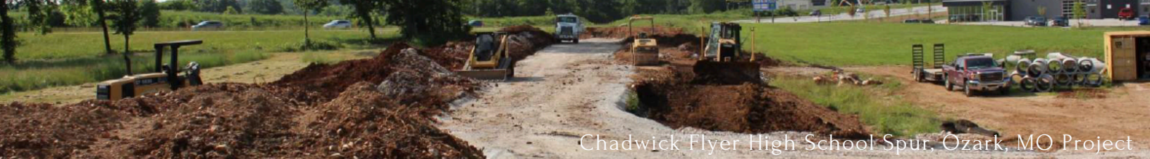
Chadwick Flyer High School Spur, Ozark, MO Project