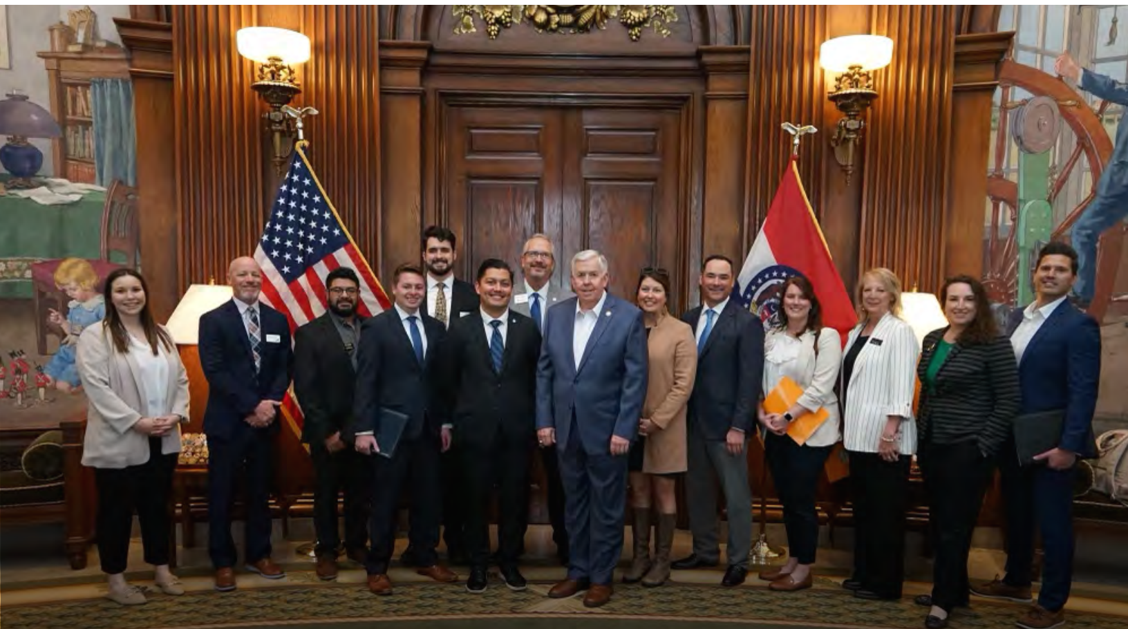
Transportation stakeholders meet with 57th Governor Mike Parson