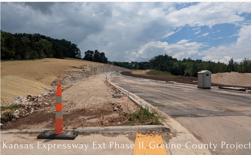
Kansas Expressway Ext Phase II, Greene County Project