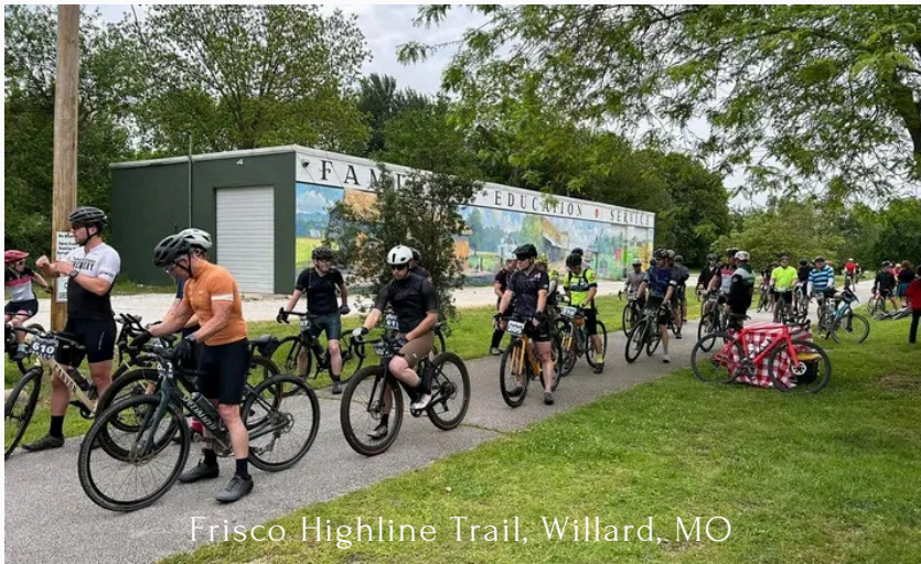
Frisco Highline Trail, Willard, MO

MoDNR is now accepting applications under the ORLP program for projects that create new outdoor recreation spaces, reinvigorate existing parks and form connections between people and outdoors.