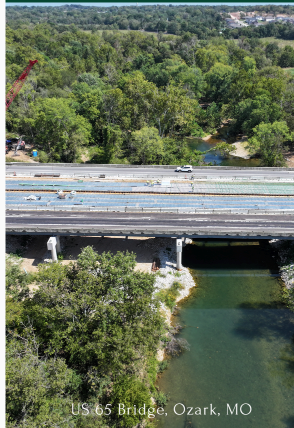
US 65 Bridge, Ozark, MO

Grant Awards for USDOT Grant Applications are currently on hold.